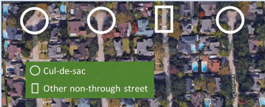
Imagery © 2020 Houston-Galveston Area Council, Maxar Technologies, Texas General Land Office, US Geological Survey. Map data ©2020 Google.